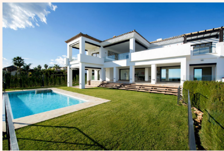
XX Street name, Suburb Sold for $X,XXX,XXX

Lorem ipsum dolor sit amet, consectetur adipiscing elit. Maecenas pellentesque, tortor vitae euismod auctor, quam enim ultricesetus, ac dictum leo lacus at massa. Suspendisse potenti. Ut fermentum elementum consectetur. In sed sodales erat. Integer diam nibh, ullamcorper et ultrices ut, convallis at eros. Pellentesque mollis quis massa nec entum.