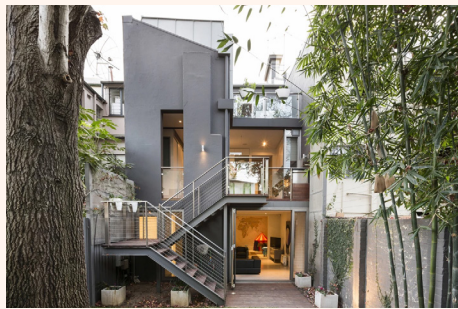
XX Street name, Suburb Sold for $X,XXX,XXX

Lorem ipsum dolor sit amet, consectetur adipiscing elit. Maecenas pellentesque, tortor vitae euismod auctor, quam enim ultricesetus, ac dictum leo lacus at massa. Suspendisse potenti. Ut fermentum elementum consectetur. In sed sodales erat. Integer diam nibh, ullamcorper et ultrices ut, convallis at eros. Pellentesque mollis quis massa nec entum.