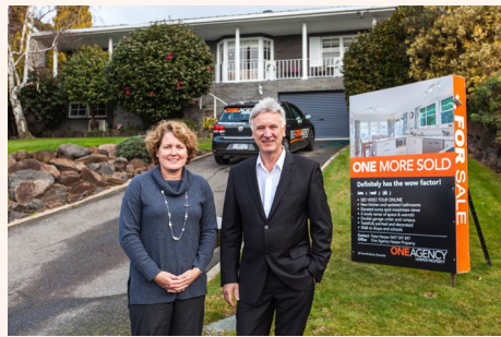
XX Street name, Suburb Sold for $X,XXX,XXX

Lorem ipsum dolor sit amet, consectetur adipiscing elit. Maecenas pellentesque, tortor vitae euismod auctor, quam enim ultricesetus, ac dictum leo lacus at massa. Suspendisse potenti. Ut fermentum elementum consectetur. In sed sodales erat. Integer diam nibh, ullamcorper et ultrices ut, convallis at eros. Pellentesque mollis quis massa nec entum.