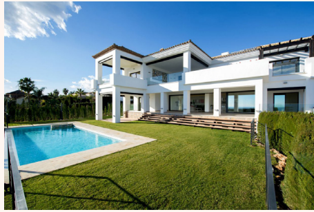
XX Street name, Suburb Sold for $X,XXX,XXX

Lorem ipsum dolor sit amet, consectetur adipiscing elit. Maecenas pellentesque, tortor vitae euismod auctor, quam enim ultricesetus, ac dictum leo lacus at massa. Suspendisse potenti. Ut fermentum elementum consectetur. In sed sodales erat. Integer diam nibh, ullamcorper et ultrices ut, convallis at eros. Pellentesque mollis quis massa nec entum.