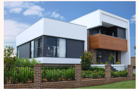
XX Street name, Suburb Sold for $X,XXX,XXX

Lorem ipsum dolor sit amet, consectetur adipiscing elit. Maecenas pellentesque, tortor vitae euismod auctor, quam enim ultriceset, ac dictum leo lacus at massa. Suspendisse potenti. Ut fermentum elementum consectetur. In sed sodales erat. Integer diam nibh, ullamcorper et ultrices ut, convallis at eros. Pellentesque mollis quis massa nec etiam.