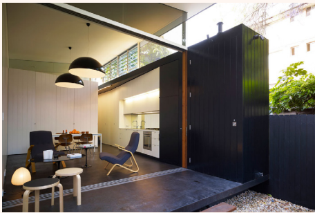
XX Street name, Suburb Sold for $X,XXX,XXX

Lorem ipsum dolor sit amet, consectetur adipiscing elit. Maecenas pellentesque, tortor vitae euismod auctor, quam enim ultriceset, ac dictum leo lacus at massa. Suspendisse potenti. Ut fermentum elementum consectetur. In sed sodales erat. Integer diam nibh, ullamcorper et ultrices ut, convallis at eros. Pellentesque mollis quis massa nec etiam.