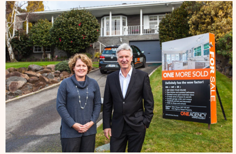
XX Street name, Suburb Sold for $X,XXX,XXX

Lorem ipsum dolor sit amet, consectetur adipiscing elit. Maecenas pellentesque, tortor vitae euismod auctor, quam enim ultricesetus, ac dictum leo lacus at massa. Suspendisse potenti. Ut fermentum elementum consectetur. In sed sodales erat. Integer diam nibh, ullamcorper et ultrices ut, convallis at eros. Pellentesque mollis quis massa nec entum.