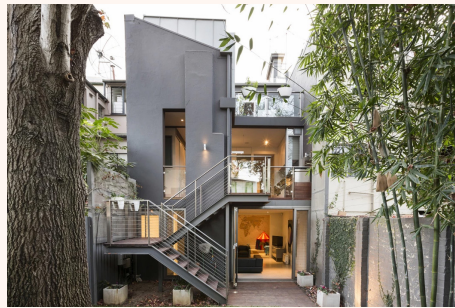
XX Street name, Suburb Sold for $X,XXX,XXX

Lorem ipsum dolor sit amet, consectetur adipiscing elit. Maecenas pellentesque, tortor vitae euismod auctor, quam enim ultriceset, ac dictum leo lacus at massa. Suspendisse potenti. Ut fermentum elementum consectetur. In sed sodales erat. Integer diam nibh, ullamcorper et ultrices ut, convallis at eros. Pellentesque mollis quis massa nec etiam.