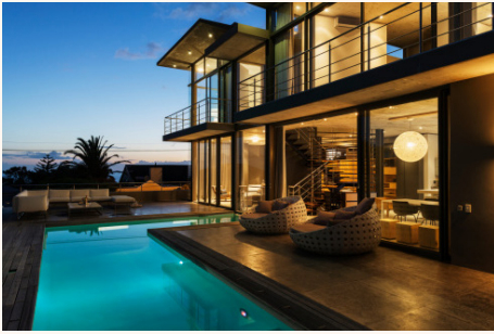
XX Street name, Suburb Sold for $X,XXX,XXX

Lorem ipsum dolor sit amet, consectetur adipiscing elit. Maecenas pellentesque, tortor vitae euismod auctor, quam enim ultricesetus, ac dictum leo lacus at massa. Suspendisse potenti. Ut fermentum elementum consectetur. In sed sodales erat. Integer diam nibh, ullamcorper et ultrices ut, convallis at eros. Pellentesque mollis quis massa nec entum.